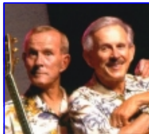
The Smother Brothers

Ray Romano Damon Wayans Ellen De Generes David Letterman Dennis Miller